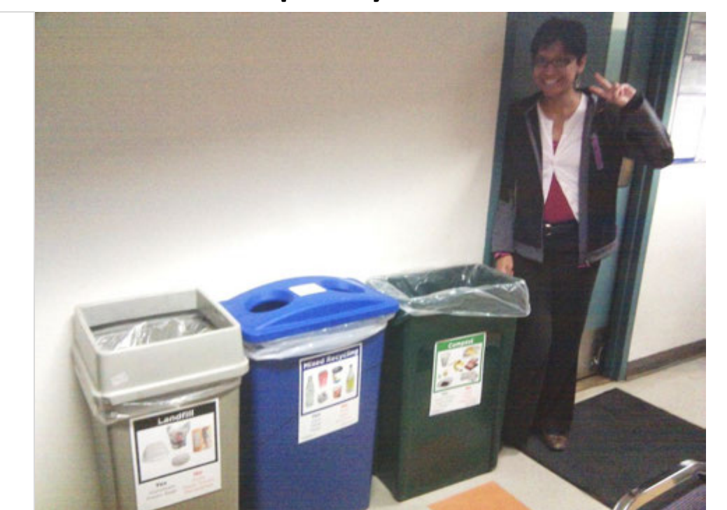
Nina rolling out enhanced recycling services