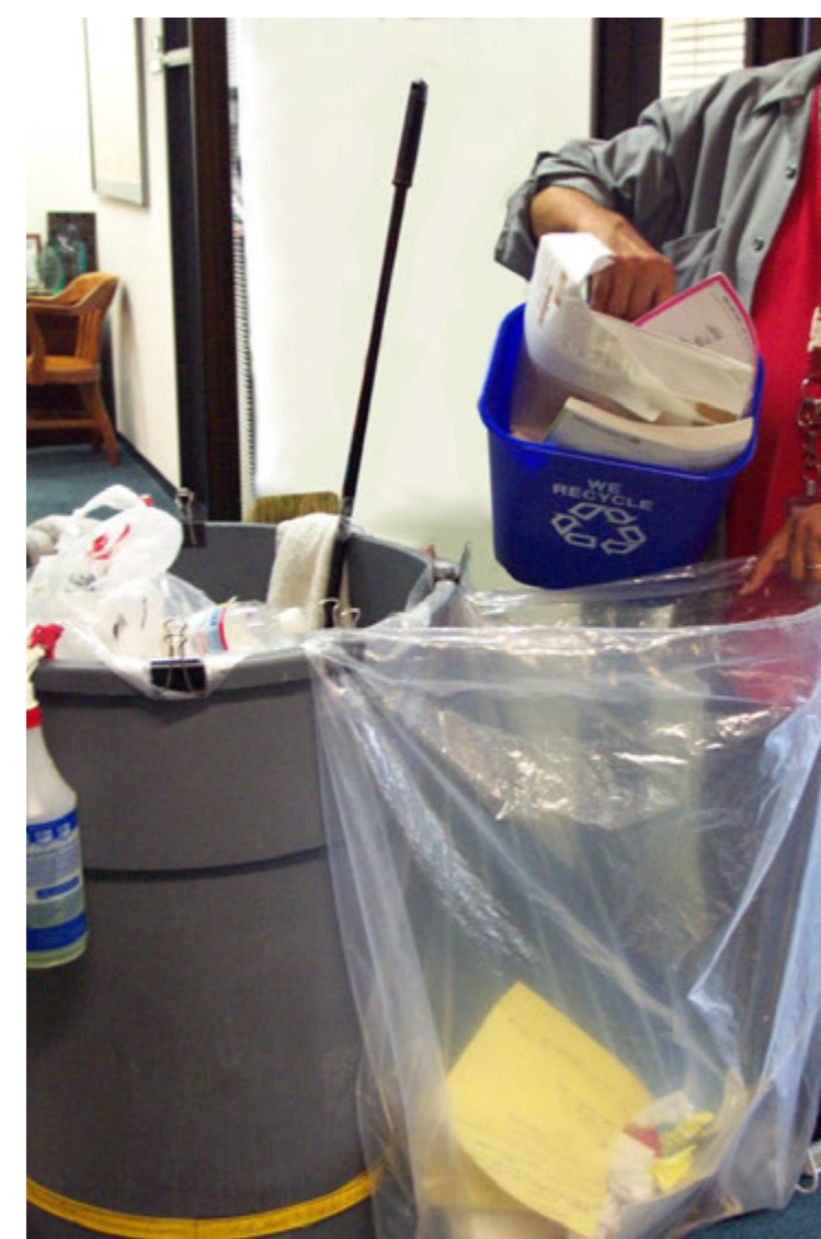
Alameda County janitor separating paper from trash