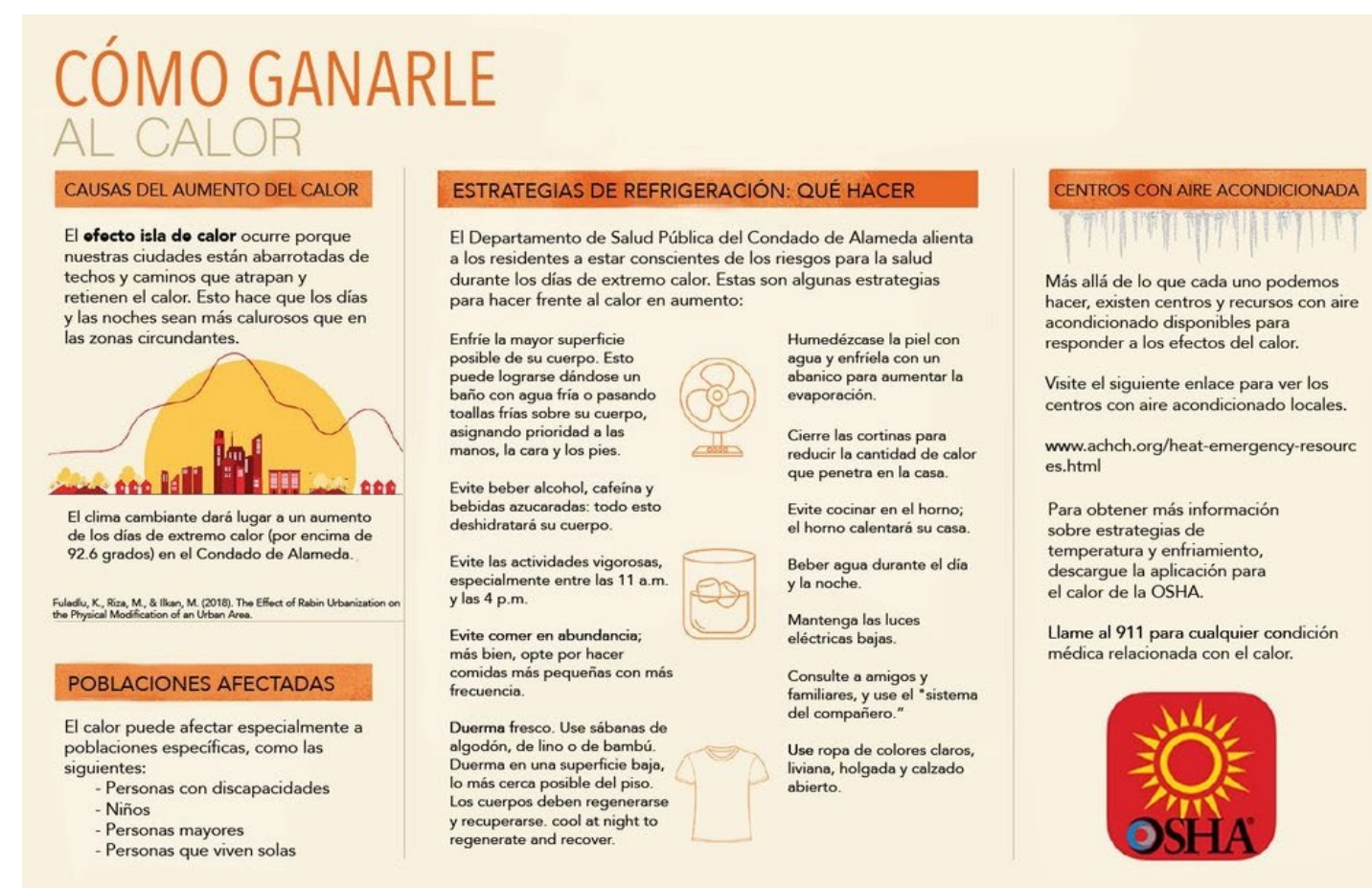
Fig 2: Heat & health flyer, translated into Spanish